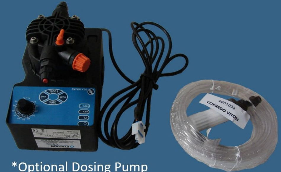
*Optional Dosing Pump