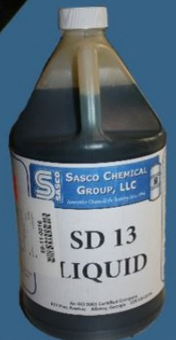
*SD-13 Recommended Detergent for Oxygen Cylinders