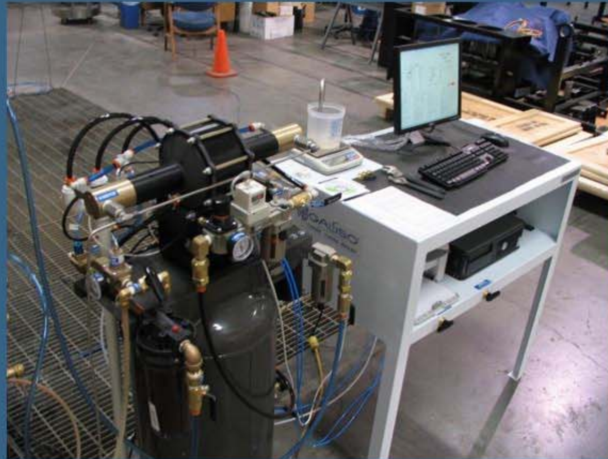
R40 With RSP