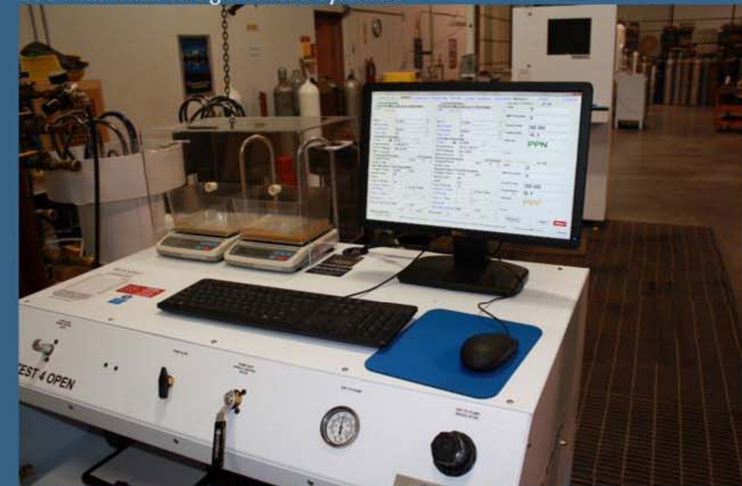
Multi-Test System – Tests 8 small cylinders in sequence, 2 at a time