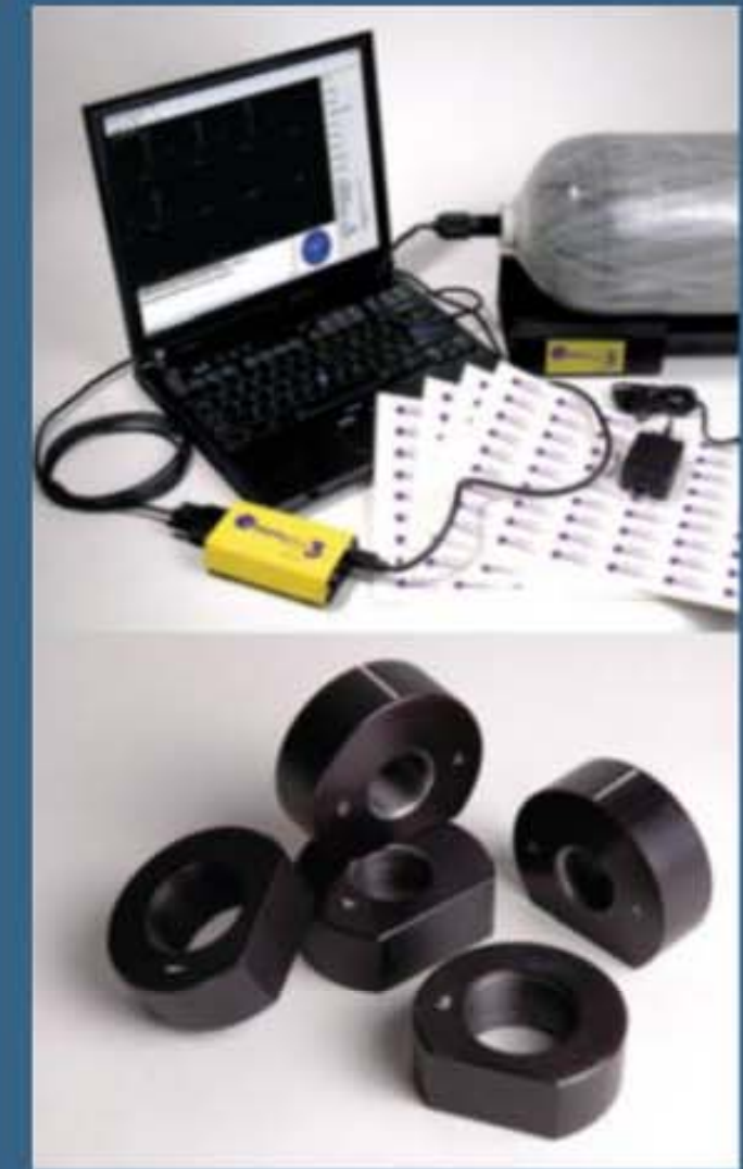
Visual Plus Galiso P/N 84-11-1100