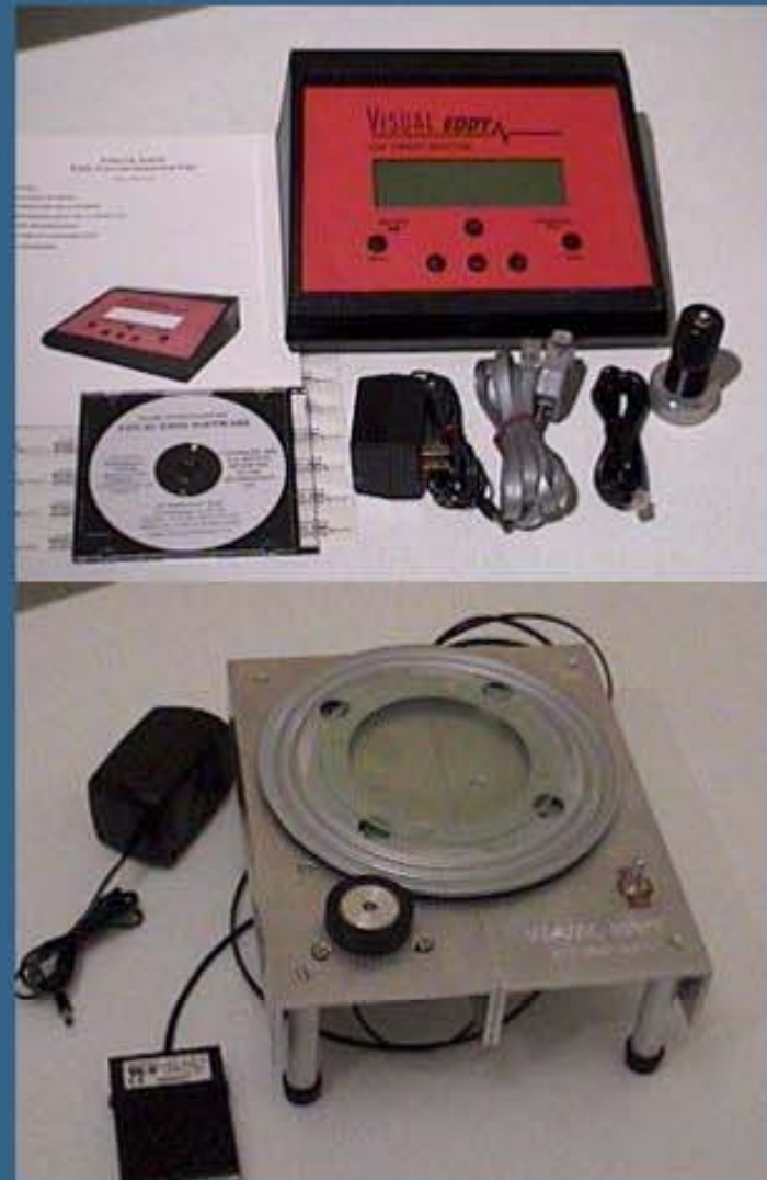
Eddy Current Integration Galiso Test Software Video