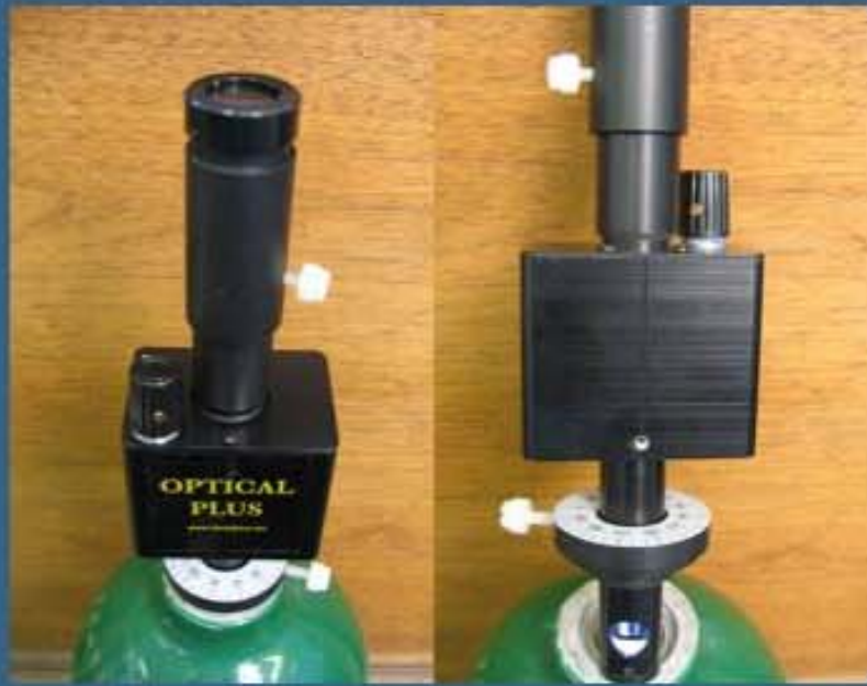
Optical Plus Galiso P/N 85-11-0077