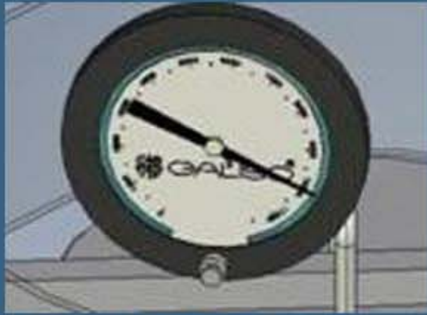
Pressure Indicating Device

Accurate within \pm 1\% of prescribed test pressure (3000psi Test pressure needs to be accurate within 30psi) of any cylinder tested that day.