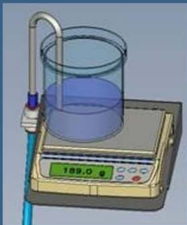
Expansion Measuring Device

Accuracy of pressure indicating device can be demonstrated at any point within 500psi of actual test pressure above 3,000psi, Or 10% of the actual test pressure for pressures below 3,000psi