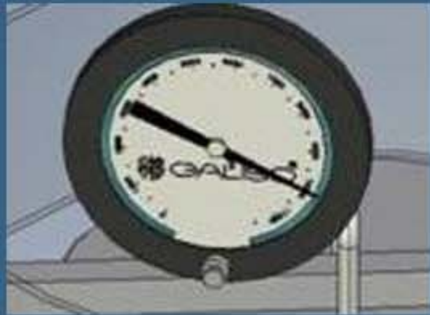
Pressure Indicating Device

Accurate within \pm 1\% of prescribed test pressure (3000psi Test pressure needs to be accurate within 30psi) of any cylinder tested that day.