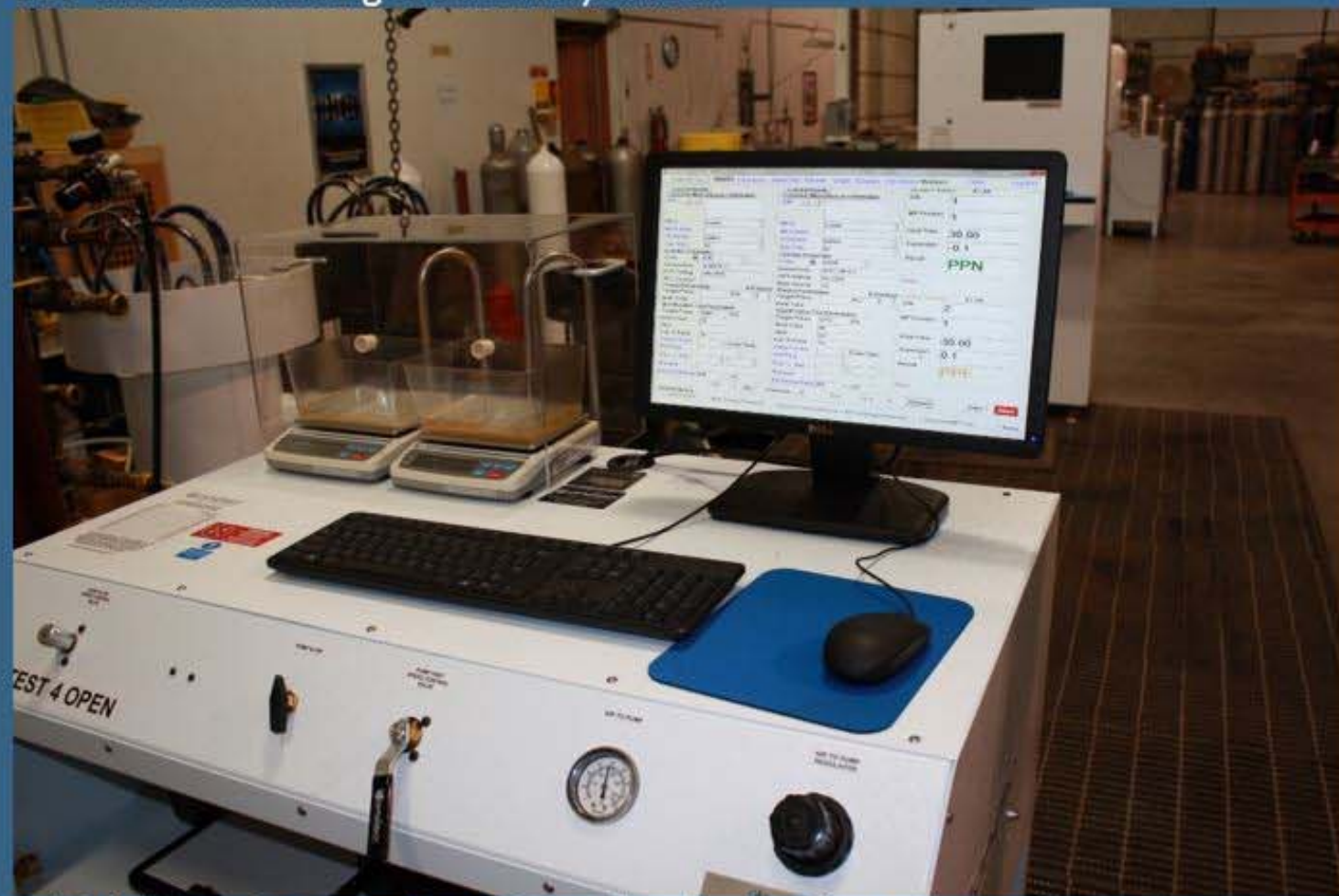
Multi-Test System – Tests 8 small cylinders in sequence 2 at a time