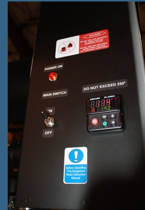
Digital Controller with Temperature Readout *Optional Separate Display With Temperature Thermocouple