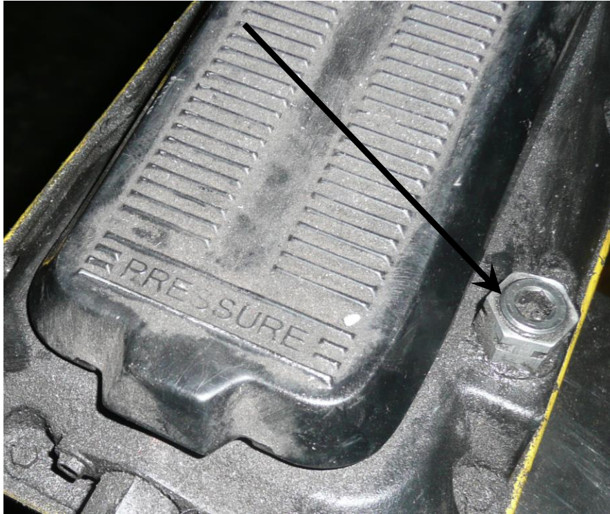
Figure 3 Vent/Fill Plug