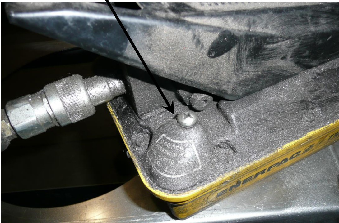
Figure 2 Vent Screw